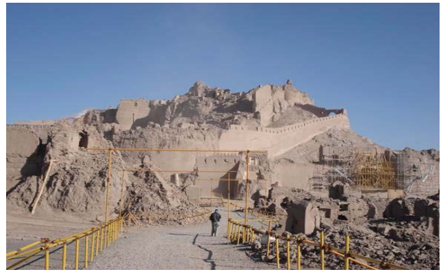
Bam Citadel World Heritage, Bam.

Sciences: UNESCO in Iran is active in different domains of natural sciences with emphasis in water resources management and biosphere reserves. Iran hosts three centers functioning under the auspices of UNESCO related to Water and one related to Science and Technology. A fourth centers related to Oceanography has been approved. UNESCO's International Hydrological Programme on the management of water resources in arid zones (G-WADI) has been active since 2005. UNESCO contributes to improved eco-system conservation and management through its "Man and Biosphere" (MAB) programme. In recent years, UNESCO has been fully involved in the popularization of sciences and the promotion of a 'culture of entrepreneurship' among the Iranian public with the aim of helping to foster a knowledge-based society and poverty eradication.