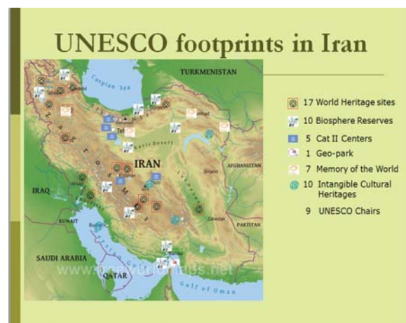
UNESCO footprints in Iran.

which is a sub-regional office for four countries (Afghanistan, Iran, Pakistan and Turkmenistan). UTCO works closely with various governmental and non-governmental partners to create conditions for genuine dialogue on cultural and scientific issues. UNESCO in Iran operates in the field of Education, Natural Sciences, Culture and Communication as detailed below.