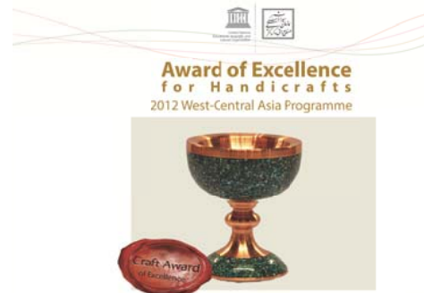
Award of Excellence for Handicrafts.

the fight against illicit traffic of cultural properties. UNESCO also facilitates intercultural dialogue within the region, such as its philosophy of outstanding universal value. In 2012, a Regional UNESCO Category II Centre for Research on Safeguarding of Intangible Cultural Heritage (ICH) was established in Tehran.