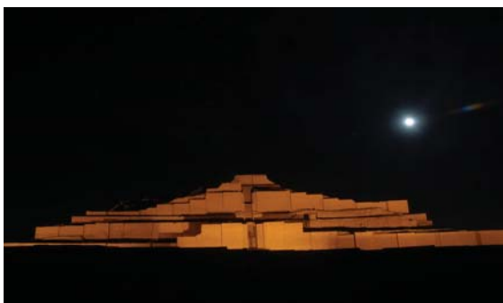
Conservation of World Heritage, Chogha Zanbil, Khuzestan Province.